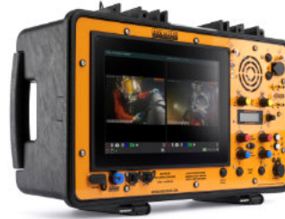
DIVER COMMUNICATION & VIDEO RECORDER