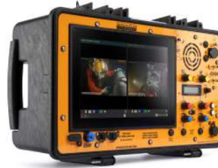
DIVER COMMUNICATION & VIDEO RECORDER